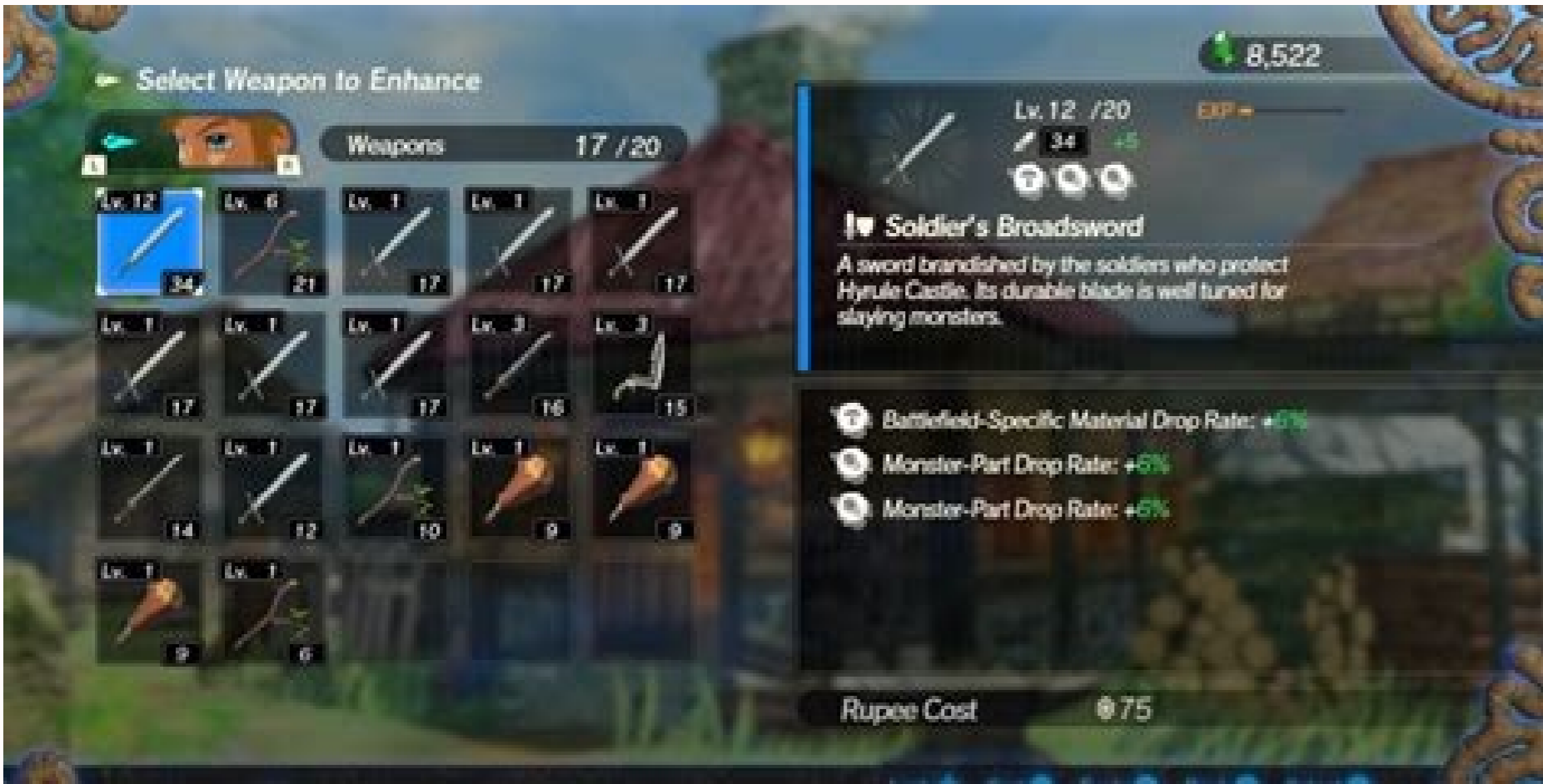
Hyrule warriors age of calamity weapon upgrade guide.